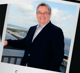
Senator Don Gaetz